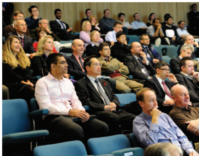
Question Writers for the SQGs attend a briefing session

The methodology at the core of our examinations and resulting outcomes are reported and discussed in the medical literature. Please refer to the recent publications cited on page 12 for more detail.