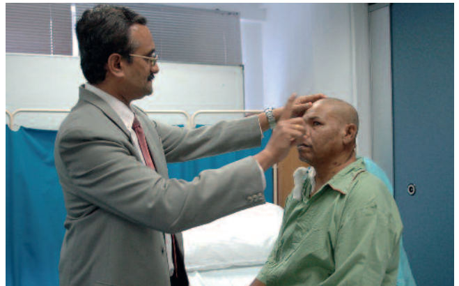
In UK and international centres scenarios mimic clinical situations