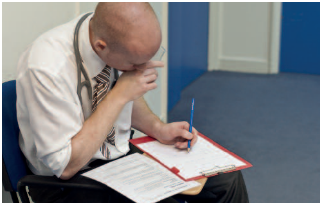
A candidate prepares for Station 4 (Communication and Ethics)