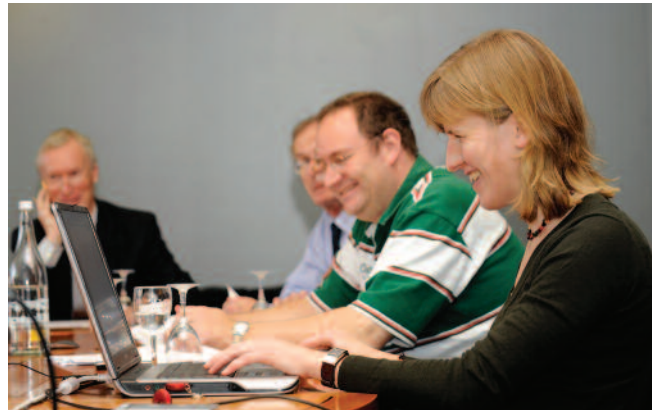
Meetings are an important part of peer review