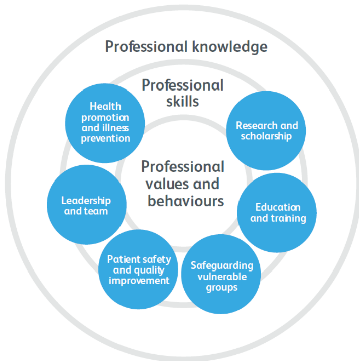
The nine domains of the GMC's Generic Professional Capabilities

Good medical practice (GMP) 9 is embedded at the heart of the GPC framework. In describing the principles, duties and responsibilities of doctors the GPC framework articulates GMP as a series of achievable educational outcomes to enable curriculum design and assessment.